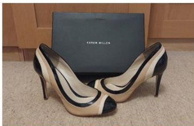
4) Barely-worn Karen Millen Heels - £25 Size 39 (6), with box.