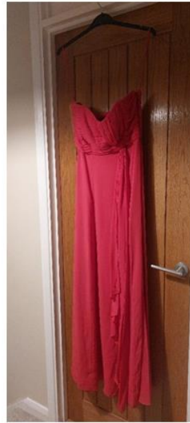
8) Barely worn - £10 Size 12 Coast, strapless long, light red dress.