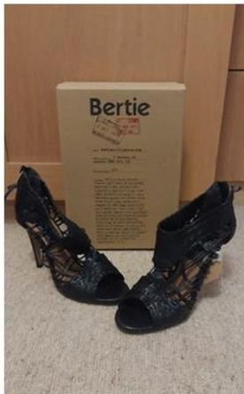
9) Barely worn Bertie ankle boots - £15 Size 40 (6.5), open toes, black leather heels.