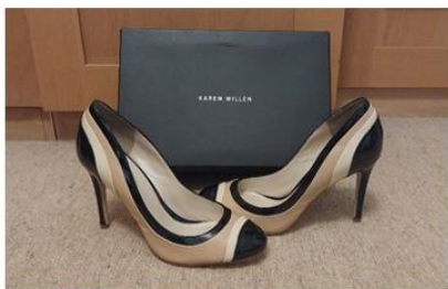
4) Barely-worn Karen Millen Heels - £25 Size 39 (6), with box.