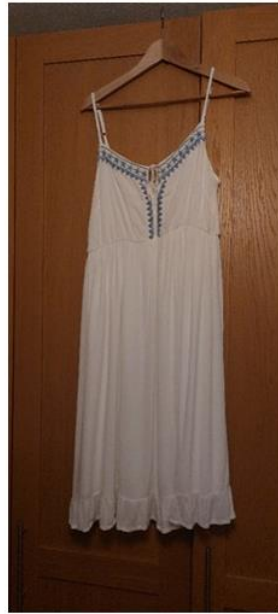
7) Brand new with tags - £10 Size 12 Seraphine maternity white, just below knee, zip bust.