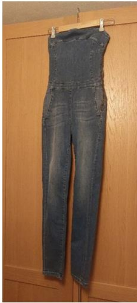
6) Brand new with tags - £50 Original price showing at £275! Donna Ida denim jumpsuit, XS