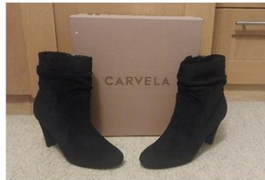
5) Brand new Carvela ankle boots - £30 Black suede, size 38 (5), with box.