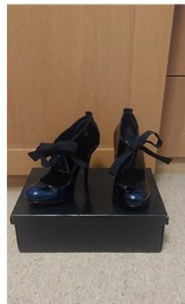
10) Brand new Top Shop ribbon lace shoes - £20 Size 38 (5) Dark blue patent, high heels, with box.